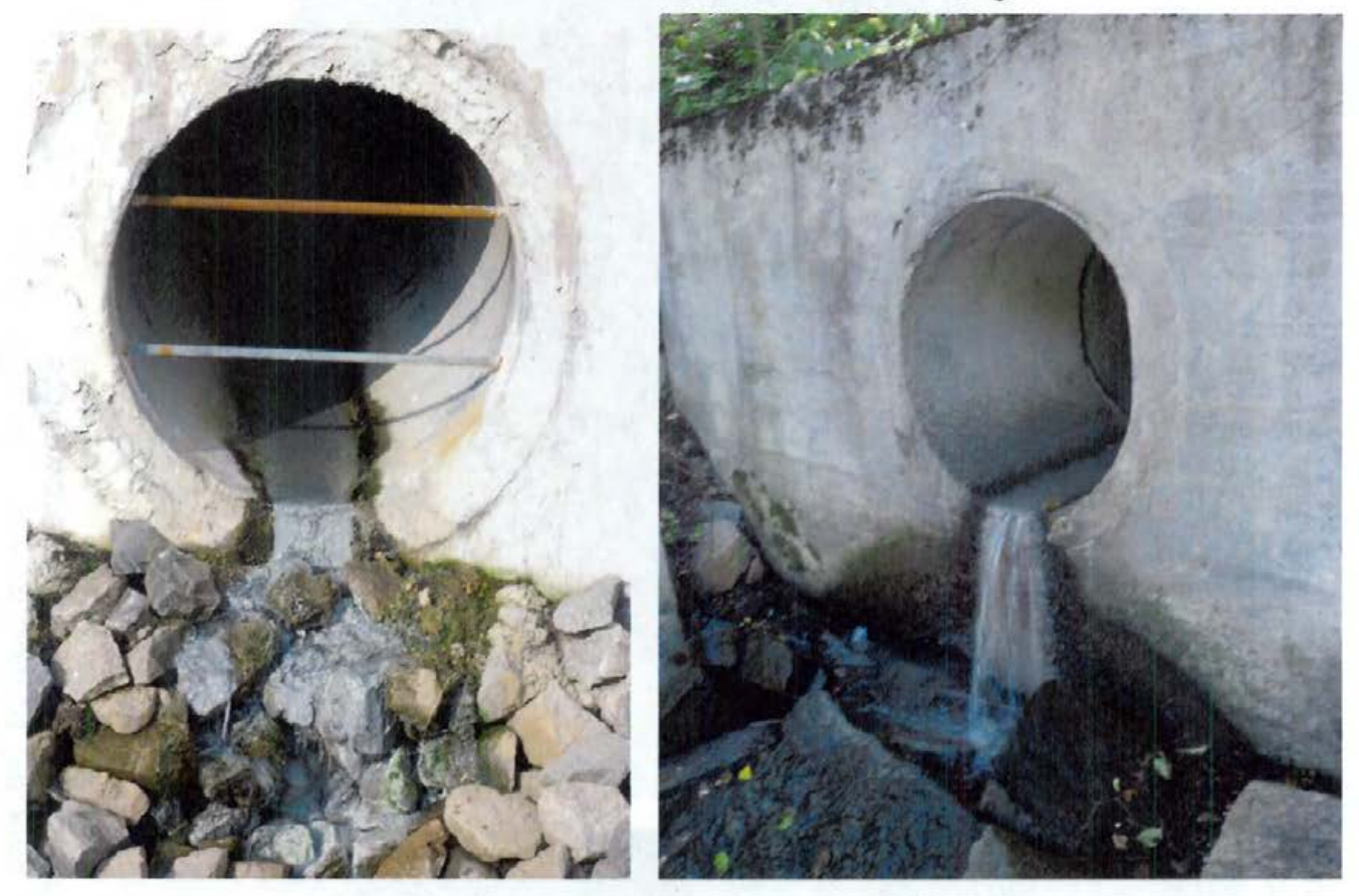
Note white, gray, or off-white filamentous bacterial growth

EPA NE Bacterial Source Tracking Protocol – Attachment 1 Stormwater Outfalls With Indicators of Illicit Discharges