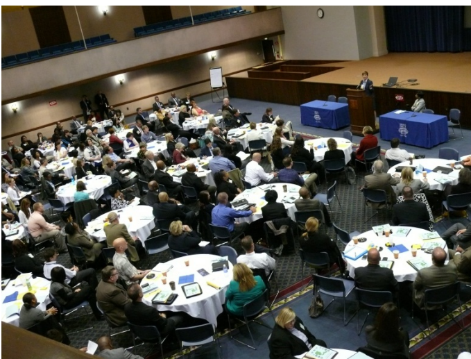
The statewide re-entry summit featured speakers on overcoming barriers to successful re-entry for returning citizens.