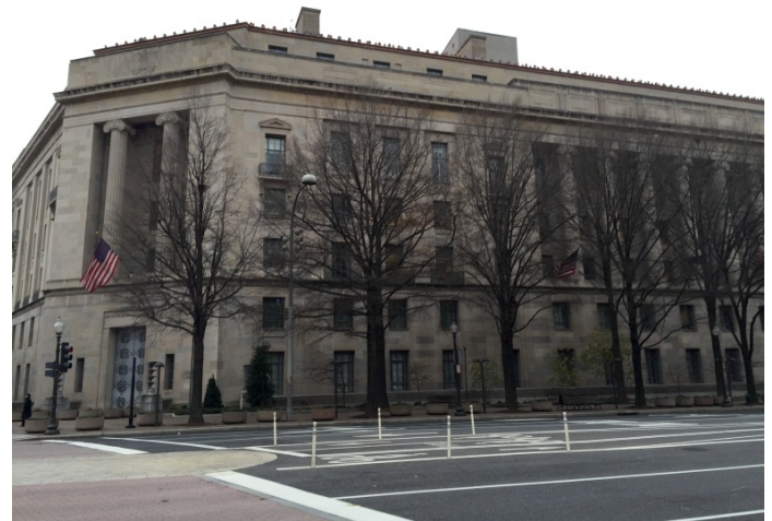
The Robert F. Kennedy Main Justice Building on Pennsylvania Avenue in Washington, D.C. serves as headquarters for the U.S. Department of Justice.

False Claims. U.S. Bank agreed to pay the United States $200 million to resolve allegations that it violated the False Claims Act by knowingly underwriting mortgage loans insured by the Federal Housing Administration that did not meet applicable requirements. In this case brought by the Department of Justice's Civil Division, along with the U.S. Attorney's Offices for the Eastern District of Michigan and the Northern District of Ohio, U.S. Bank admitted that its actions caused FHA to insure thousands of loans that were not eligible for insurance and that FHA suffered substantial losses on insurance claims.