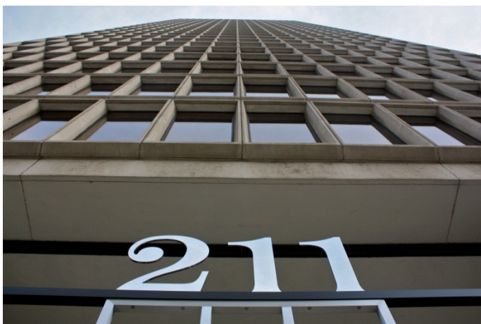
211 West Fort Street houses the Detroit headquarters of the U.S. Attorney's Office for the Eastern District of Michigan.