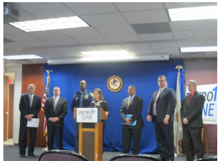
Detroit One partners announce the federal carjacking enforcement strategy and public awareness campaign.

In United States v. Cortez , two defendants were convicted at trial for their involvement in distributing more than 100 kilograms of cocaine in Detroit from a Mexican drug cartel. The defendants transported the drugs concealed in a hidden compartment constructed under the wheelchair ramp of a van. Seizures in the case included 16 kilograms of cocaine in Detroit, 30 kilograms in Houston and 20 firearms.