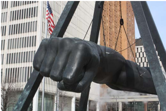
The Monument to Joe Louis, also known as “the Fist,” memorializes the famed Detroit boxer and symbolizes Detroit’s resilience.

a telemarketing scheme by offering for sale residential properties in Detroit for the purpose of “flipping” them to other buyers. The defendants inflated the value of the homes. After a buyer purchased a home, the defendants represented that the home had been sold for a profit, and then persuaded the buyer to purchase additional properties. The scheme victimized 290 buyers in 46 states and Canada.