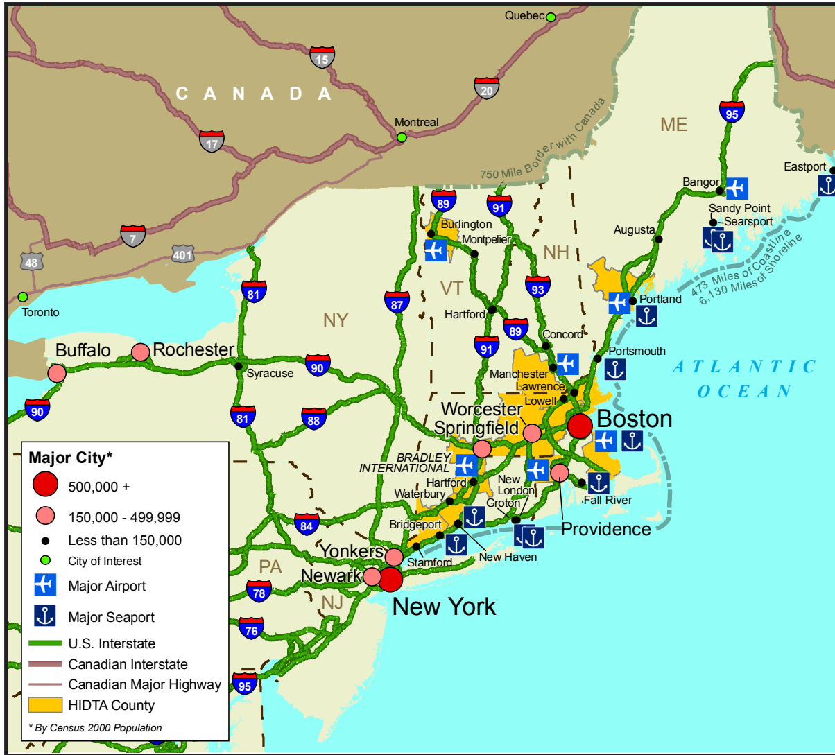
Map A1. New England High Intensity Drug Trafficking Area

The NE HIDTA region comprises 13 counties in six states, including six counties in Massachusetts, three in Connecticut, and one each in Maine, New Hampshire, Rhode Island, and Vermont. 40 Bridgeport, Hartford, and New Haven (CT); Boston, Brockton, Cambridge, Lynn, Springfield, and Worcester (MA); Portland (ME); Manchester (NH); Providence (RI); and Burlington (VT) are the largest cities in the HIDTA counties. 41 Approximately 8.9 million residents, 61.4 percent of the New England population, reside in the HIDTA region. 42 Drug distribution within the NE HIDTA region is centered in two primary hubs located in the Hartford (CT)/Springfield (MA) and Lowell/Lawrence (MA) areas. 43 The Providence (RI)/Fall River (MA) area is a secondary distribution center that supplies Cape Cod. 44 Boston is New England's largest city and is predominantly a consumer drug market supplied primarily by distributors operating from Lawrence, Lowell, and the New York City metropolitan area. 45 In 2010, NE HIDTA initiatives reported seizing drugs, currency, and other assets valued at approximately $80.7 million. 46